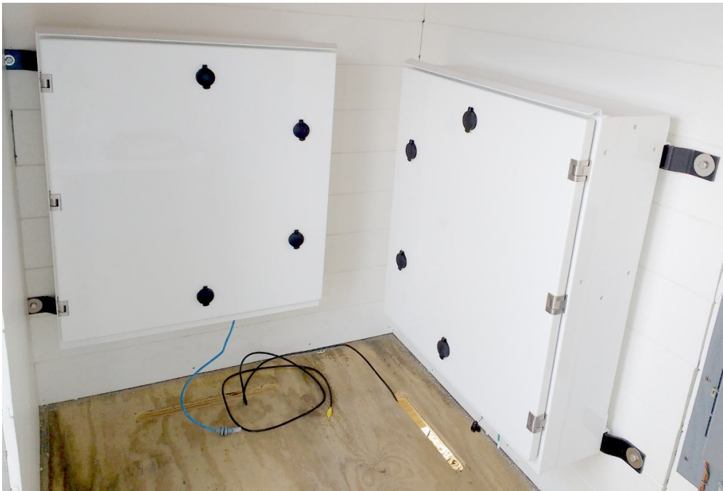
High frequency radar scatterometer installed on behalf of Woods Hole Oceanographic Institution (April 2018). On the left, receiver box, signal generator and analogue-digital converter in the upper compartment; reception cards and bandpass filters in the lower compartment. On the right, power supply box with circuit breakers, relays, power supplies, isolation transformer in the lower compartment; mounting plate for the control computer in the upper compartment.